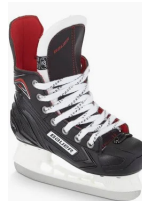
Bauer Vapor X250 Youth