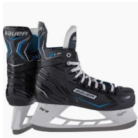
Bauer X LP Youth