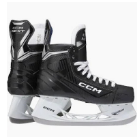
CCM Next Junior

It is very important to take your child with you when you go to purchase skates as they are a different sizing structure than their regular shoes. Skates need to fit properly for safety purposes.